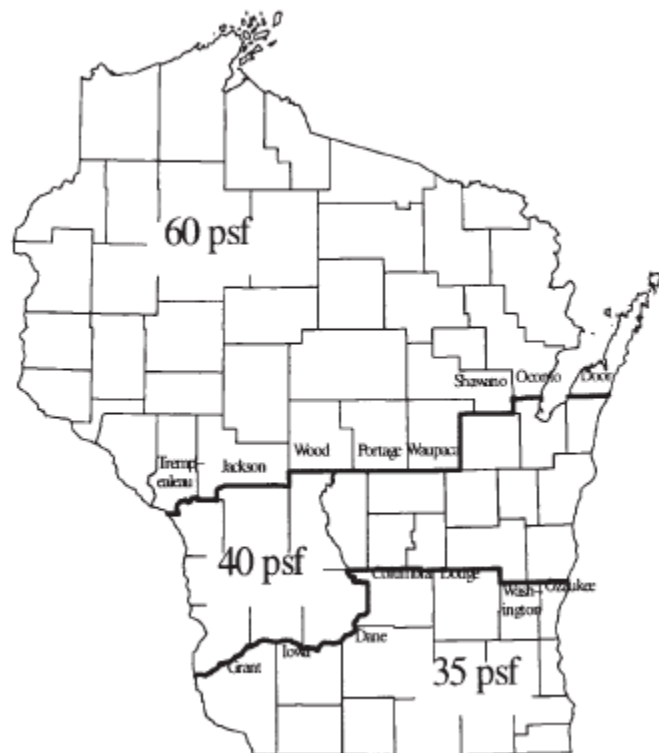
Figure 3. Wisconsin State Alternate Ground Snow Zones Map

Wisconsin. To design building with Wisconsin Commercial Building Code, the “snow” load box must be used and unbalanced roof snow load conditions must be checked. An alternate unbalanced roof snow calculation method is provided in the Wisconsin Commercial Building Code. To use alternate unbalanced roof snow load calculation, either of the following code options may be used “WISC/IBC00/ANSI95” or “WISC/IBC00/TPI2002”. Since the State of Wisconsin has adapted the 2006 International Building Code and the new Wisconsin Commercial Building Code will be effective on March 1, 2008, these building code options may be replaced by “WISC/IBC06/TPI2002” in future version of the MiTek truss design engineering program.